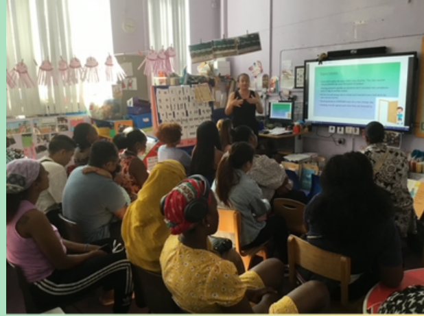
PARENTS SESSION RECEPTION Transition to Year 1 in September

+Parish website:<u>www.stjamesthegreatpeckham.org</u>