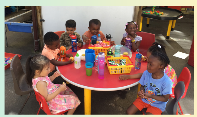
A refreshing SPA day for our Nursery children ended with a healthy snack in the shade!