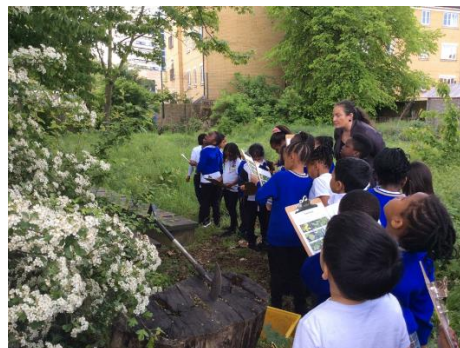
Year 1 in the garden surveying the trees for Science