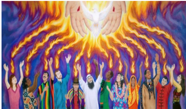
Jesus sent his Holy Spirit to be with us today.

This Sunday is Pentecost, the day when the Holy Spirit came to the Apostles and filled them with the courage to go out and spread Good News to the world. We shall take strength from this as we continue our way out of Covid life and begin to reshape what is important to us in school, our families and our parish.