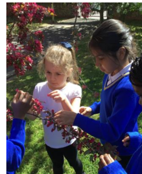
Year 3 making clay flowers inspired by our beautiful apples trees