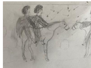
Year 5 clay coil pot and sketch inspired by learning about Greece and scenes from the Parthenon Frieze