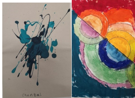
Y2 Splatter painting technique and working with warm and cold colours

Parent Meetings will take place during the planned INSET Day on Friday 27 th November by telephone. You will receive more detail by letter shortly.