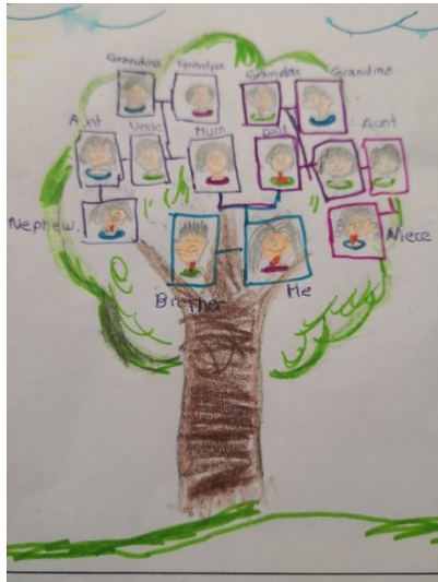
Heritage week - family of April Y1

www.stjamesthegreat.southwark.sch.uk "Doing our best for God, for others and for ourselves" Friday 22 nd October 2020