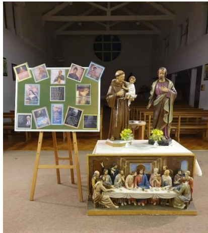
All Saints display in church

www.stjamesthegreat.southwark.sch.uk "Doing our best for God, for others and for ourselves" Friday 1 st November 2019