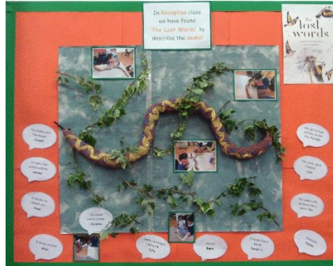
Reception class took a view on 'snakes'!

Each Wednesday morning before school starts. Please become a member , if you aren't already!