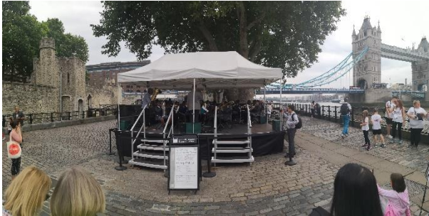
St James the Great Band perform at the Tower Water Music festival last Sunday.

www.stjamesthegreat.southwark.sch.uk "Doing our best for God, for others and for ourselves" Friday 28 th June 2019