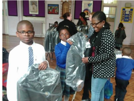
Getting fitted out with new blazers this week.

The sales are continuing apace and the 'shop' will remain open before and after school up to and including Thursday of next week.