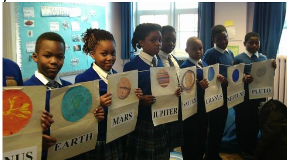
Year 5 illustrating the planets of the solar system.

Please watch out for more information from your child's class teachers.