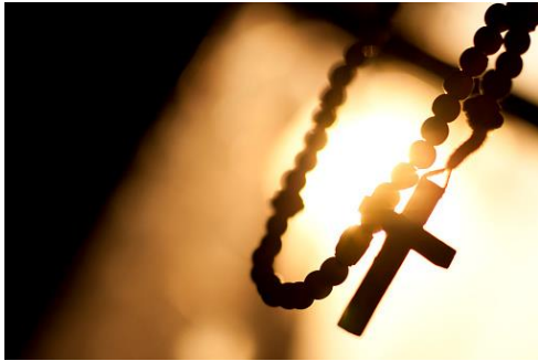
The Rosary- a garland of roses.

www.stjamesthegreat.southwark.sch.uk "Doing our best for God, for others and for ourselves" Friday 30 th September 2016