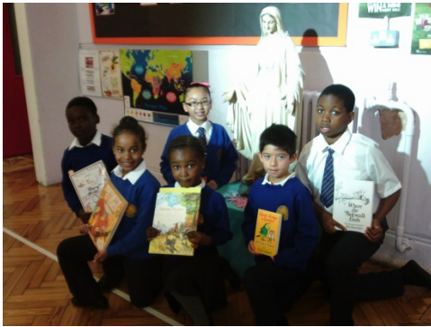
Our Poets with their prizes! See what they wrote overleaf

www.stjamesthegreat.southwark.sch.uk "Doing our best for God, for others and for ourselves" Friday 16th October 2015